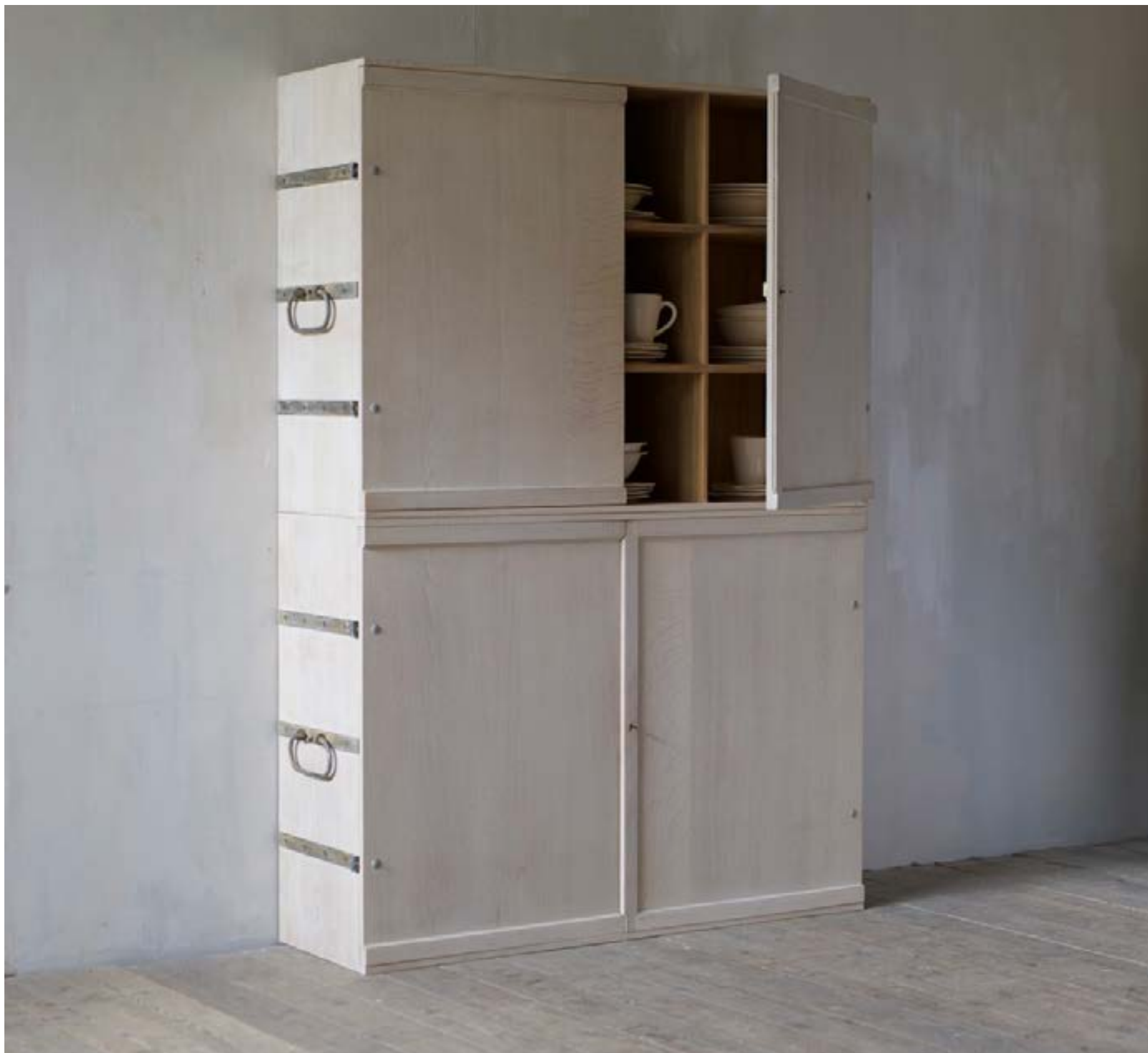
The convent cupboard in oak | double whitewash